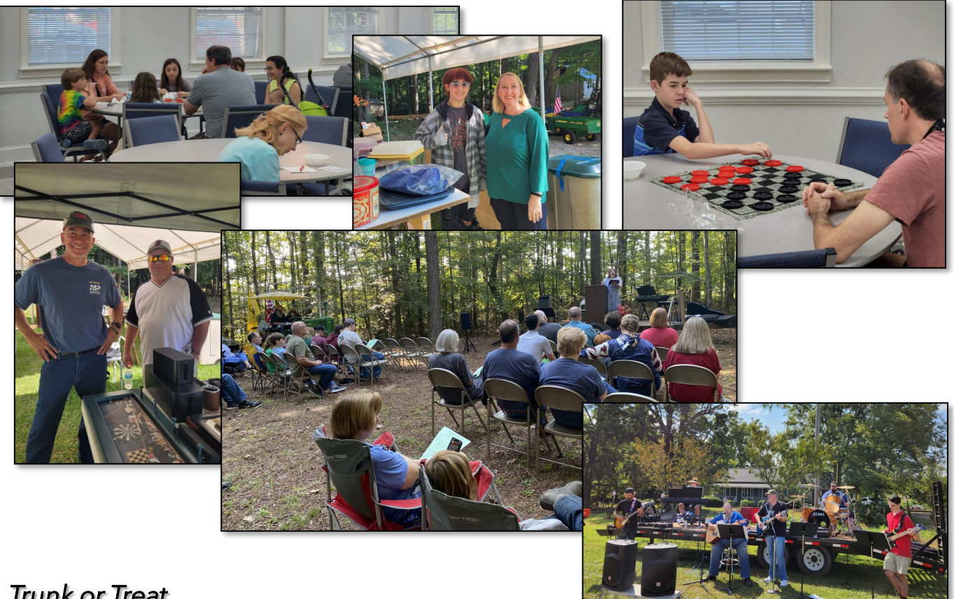
Trunk or Treat Sunday, October 30 from 5:00-6:30pm

Join us for an evening as we build relationships with the community! It will be a fun night of Trunk or Treating, a light dinner, games, and prizes,.