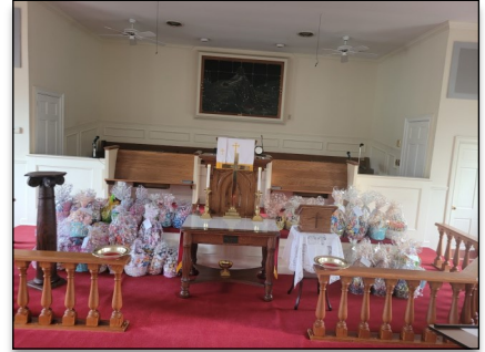
DFCS Easter Baskets 2022