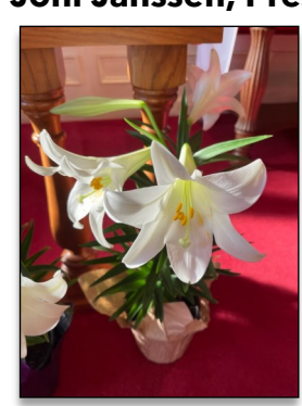
Easter Lilies 2022