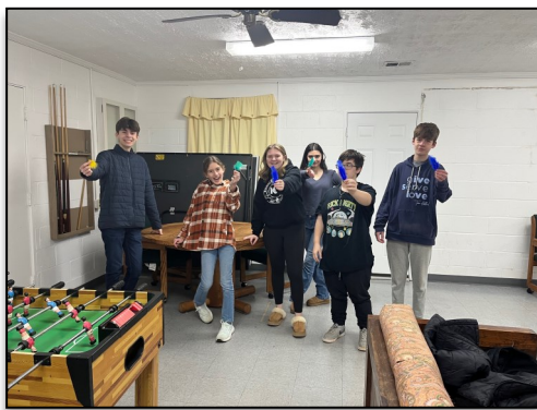
A fun time at Youth!!